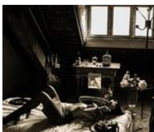
Jod de Maupassant Model