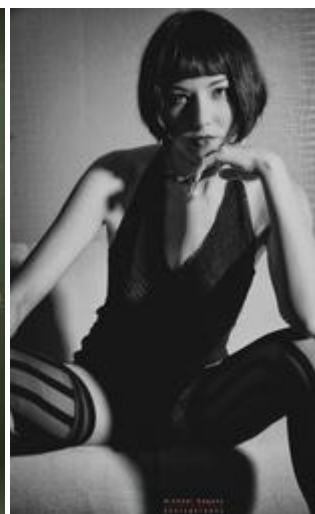
D A X S H A Model