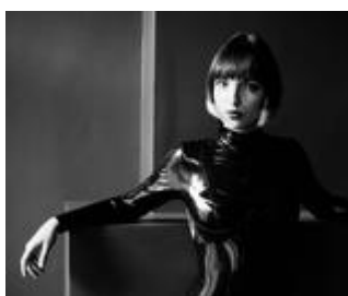
Jod de Maupassant Model