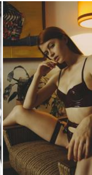
Aja Jane Model