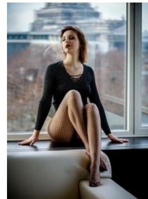
Jod de Maupassant Model